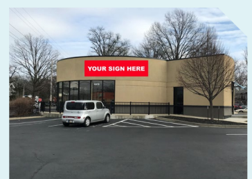
4419 Dixie Hwy. 3,600 SF Lease