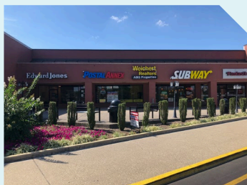
Cedar Springs Centre 113,000 SF Sale