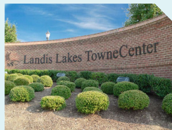
Landis Lakes Towne Center 90,520 SF Sale