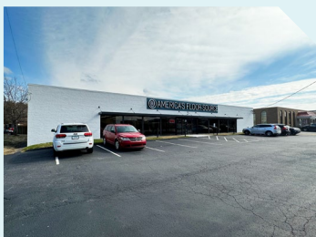
103 S. Hurstbourne Pkwy 13,905 SF Sale