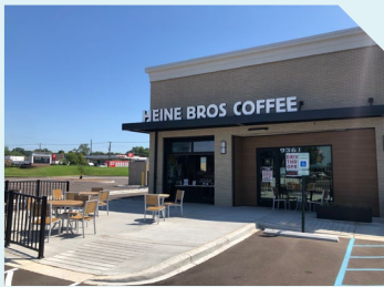
Shoppes at Hurstbourne Town Center 5,986 SF Sale