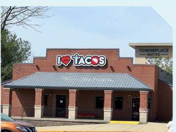
Springhurst Crossings 4,500 SF Lease