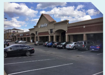
10001 Forest Green Blvd 48,716 SF Sale