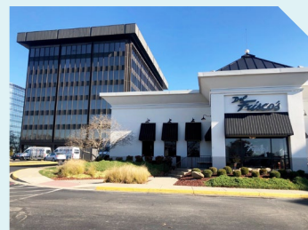
101 Whittington Pkwy 14,189 SF Sale