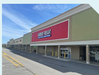
Village Plaza 7,496 SF Lease