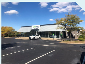
11601 Plantside Drive 5,700 SF Sale