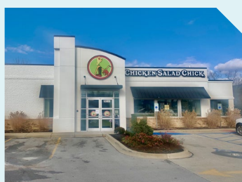
12009 Shelbyville Road 3,569 SF Lease