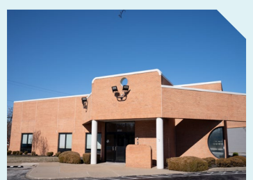
1350 Carter Road 2,610 SF Sale